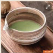
Matcha Tea bowl