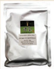
HAMASAEN Matcha powder