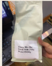
Matcha ice cream powder