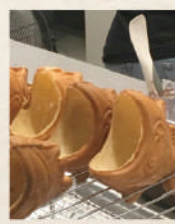
Frozen Delight Taiyaki