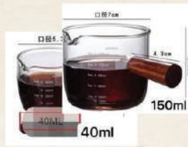
measuring cup (S) measuring cup (L)