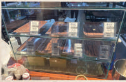
Snack show case