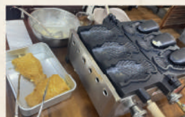
Delight Thaiyaki Baking Machine

Our premium ice cream machines are tailored to produce creamy and rich matcha soft serve