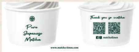
Ice Cream cup