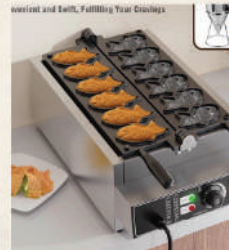
Taiyaki Baking Machine