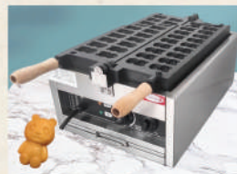
Panda Yaki Baking Machine