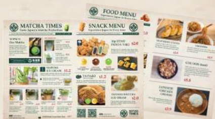
A3 laminated Menu