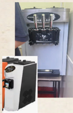
Ice Cream Machine