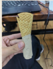
Ice cream cone